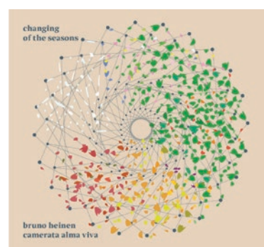
Changing of the Seasons, Babel Records, 2016